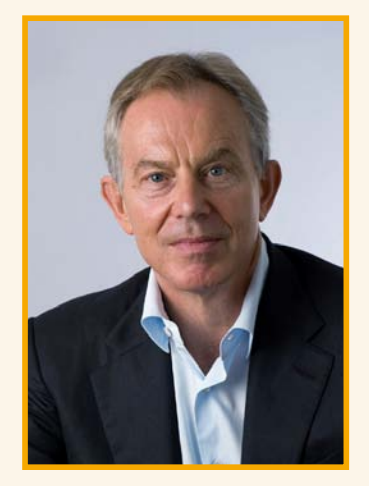
HONORABLE TONY BLAIR Former Prime Minister United Kingdom