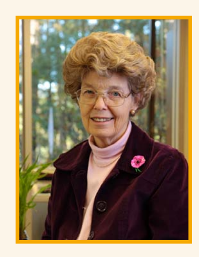
MARY-DELL CHILTON United States