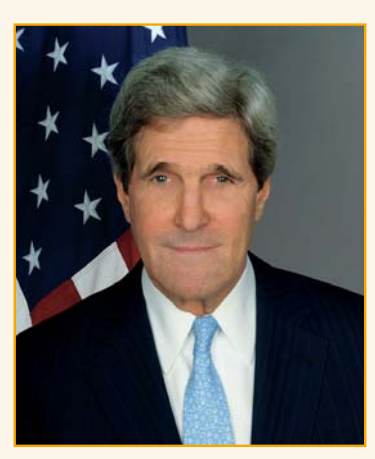
HON. JOHN KERRY Secretary of State U.S. Department of State