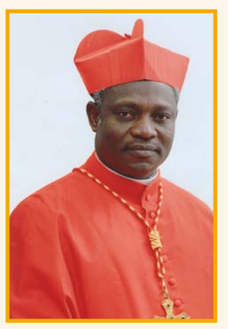
HIS EMINENCE CARDINAL PETER K. A. TURKSON Pontifical Council for Justice and Peace Holy See, The Vatican